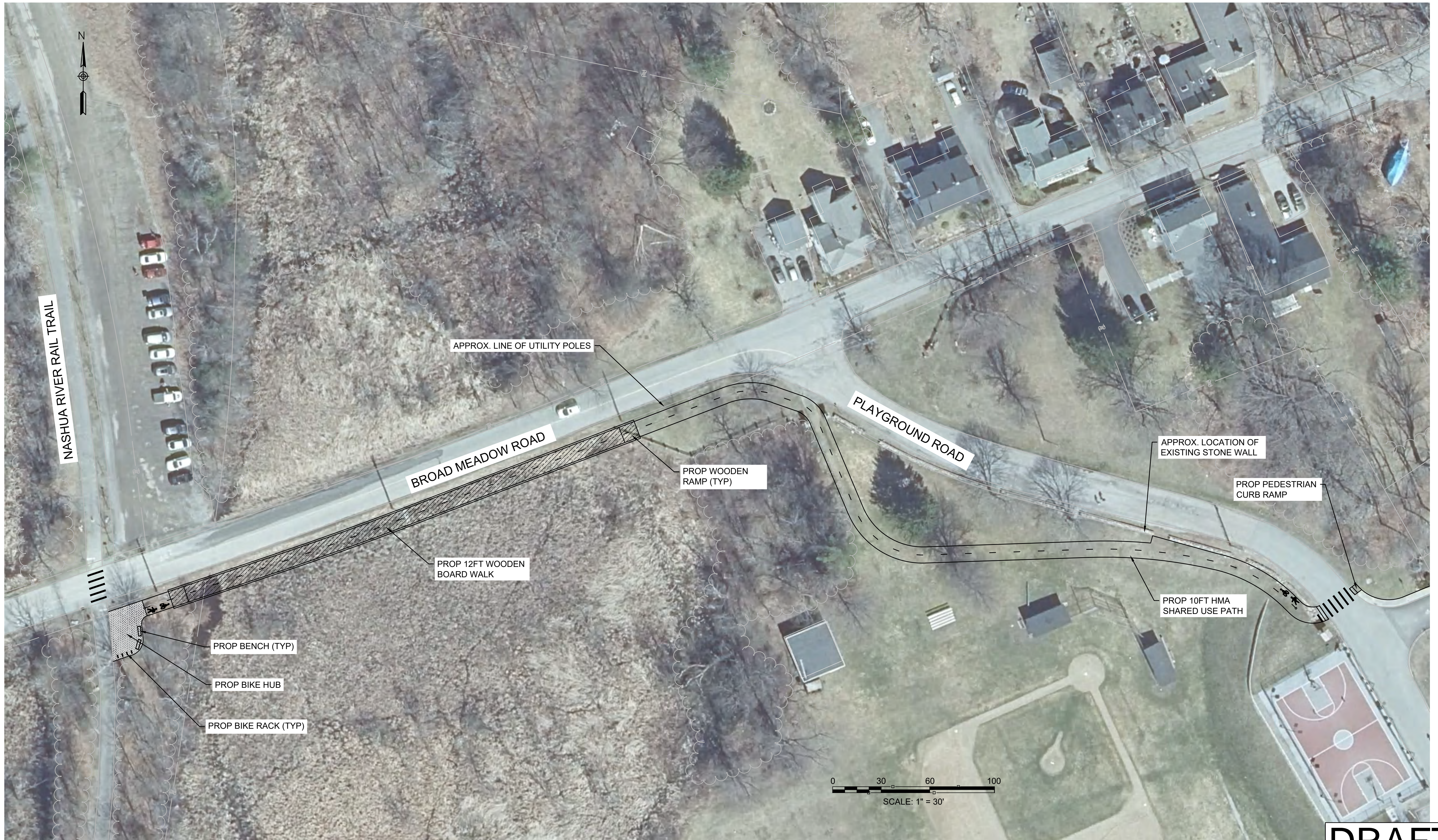
HOT MIX ASPHALT SHARED USE PATH ALONG PLAYGROUND ROAD WITH PEDESTRIAN/BICYCLE BOARD WALK ALONG BROAD MEADOW ROAD