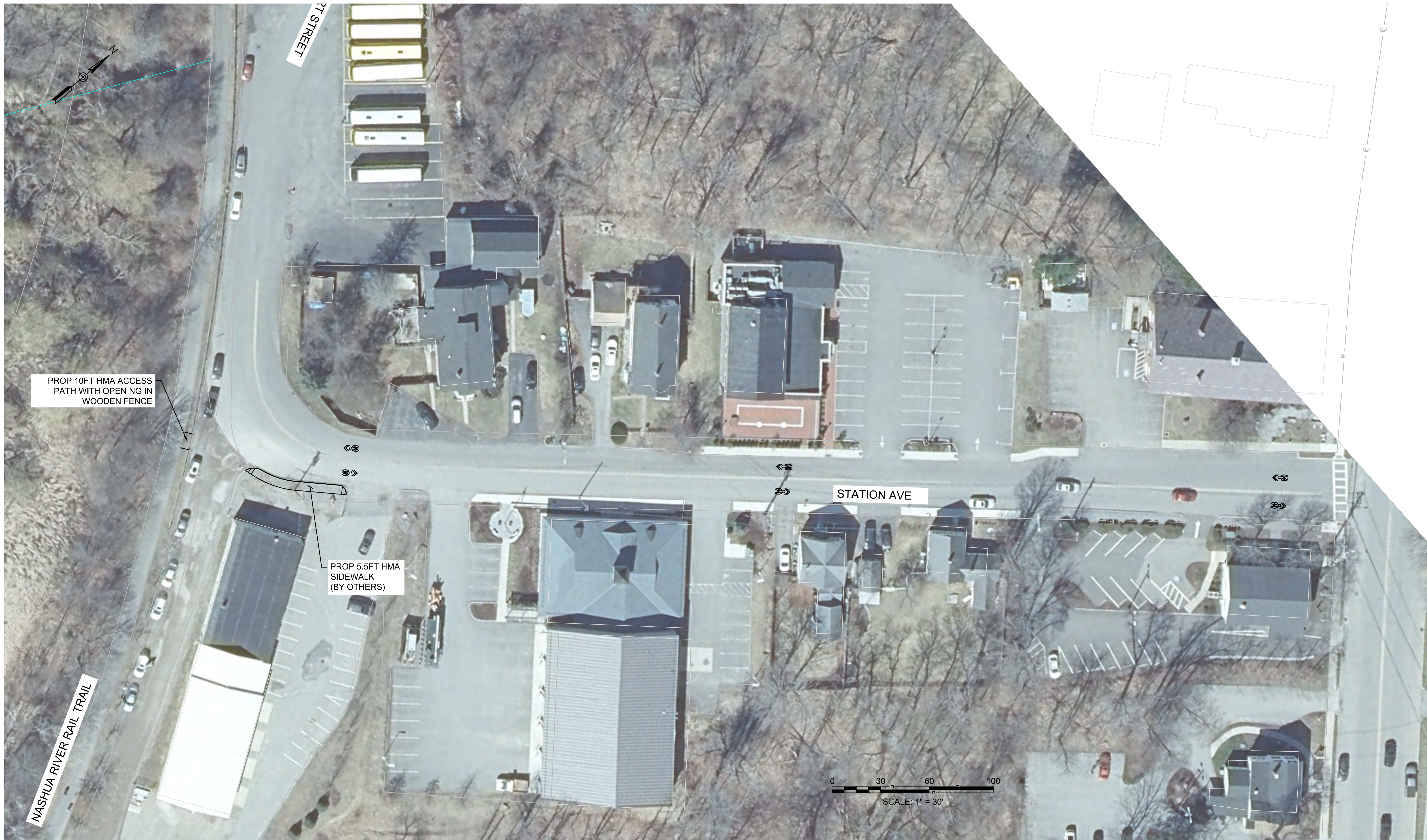
SHARED ROADWAY BICYCLE MARKINGS ALONG STATION AVENUE AND BICYCLE/PEDESTRIAN CONNECTION TO NASHUA RIVER RAIL TRAIL