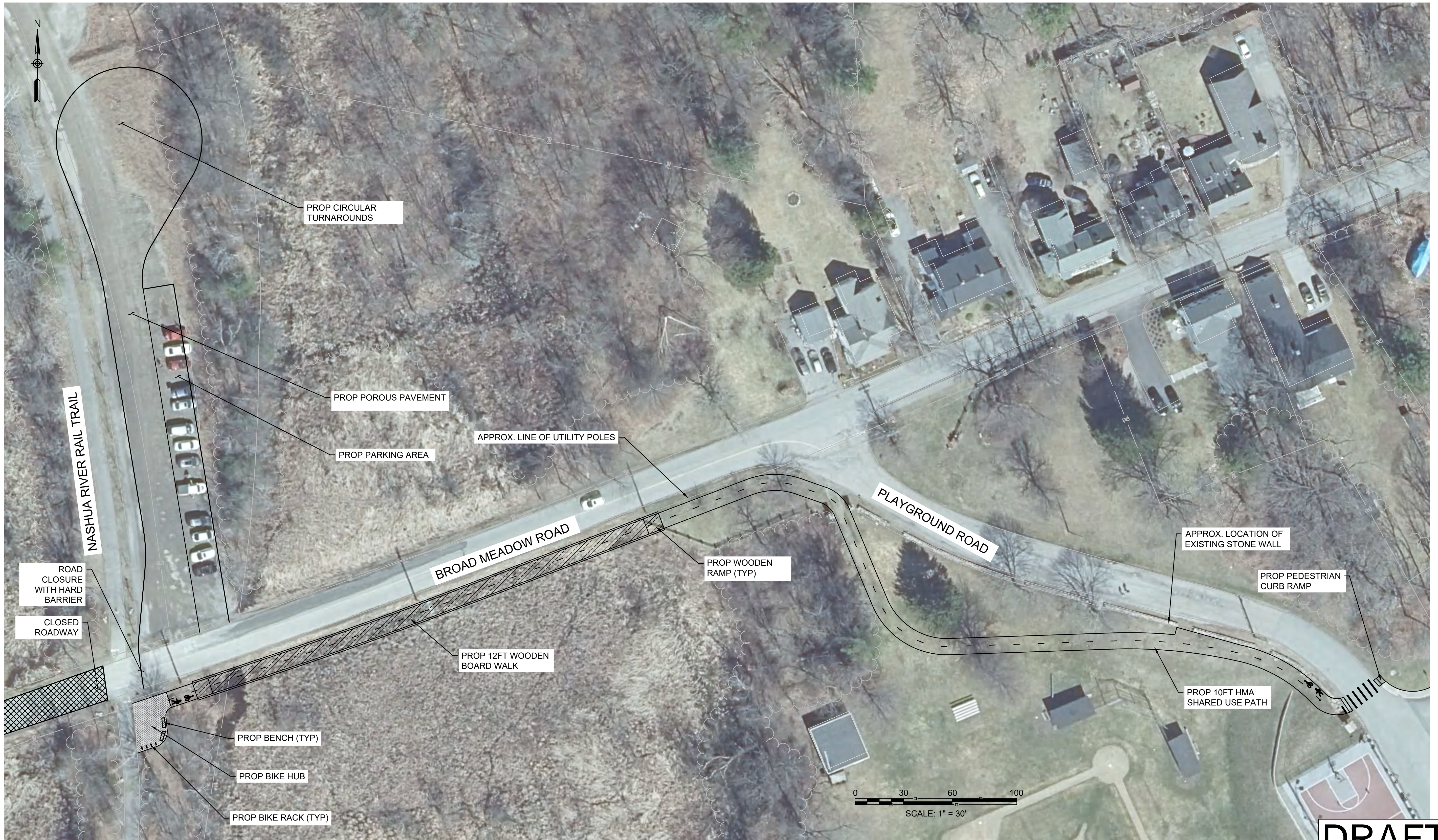
HOT MIX ASPHALT SHARED USE PATH ALONG PLAYGROUND ROAD WITH PEDESTRIAN/BICYCLE BOARD WALK ALONG BROAD MEADOW ROAD